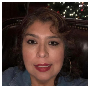
DIRECTOR- EVENTS COORDINATOR