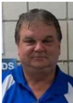
PRESIDENT/ MCA REGIONAL DIRECTOR